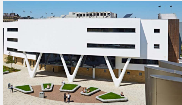
Richard Steinitz Atrium

The 2 buildings are marked in the below map.